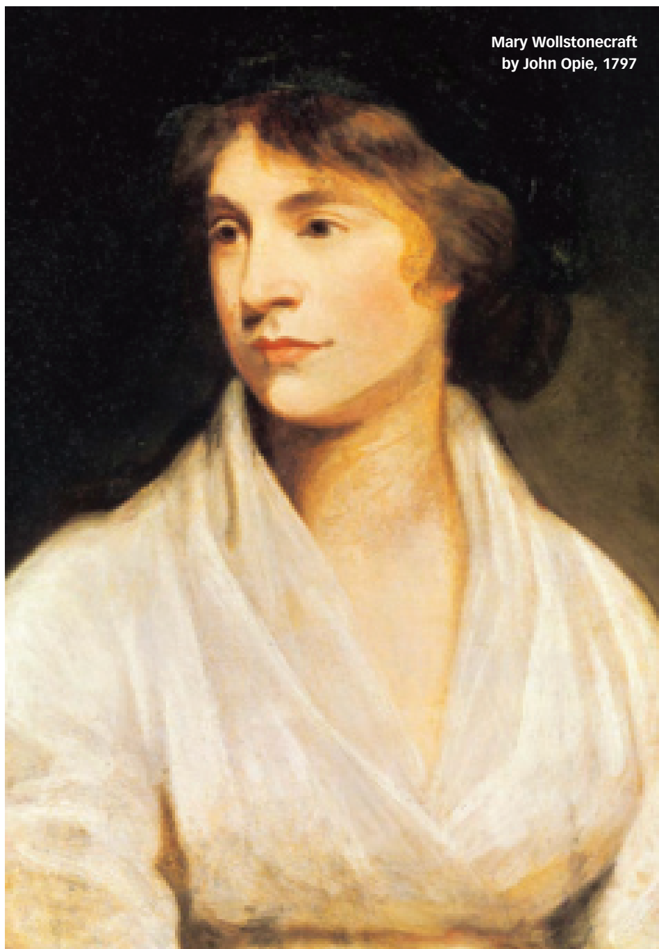
Mary Wollstonecraft by John Opie, 1797

virtue does not develop in a bed of roses; on the contrary, hardship is necessary for fortitude, and to develop a truly virtuous character. But society women were shielded from all hardship, therefore becoming 'less virtuous' in the process. Here she again reminds me of Nietzsche, who also thought that pain is necessary for developing virtue; or rather that one needs to experience life with all its ups and downs in order to grow beyond Master and Slave moralities. The idea that God puts challenges before us to make us more virtuous is also part of a Christian response to the problem of evil. So maybe Nietzsche was not that far from Christianity after all!